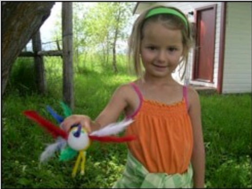
A Yampatika camper builds a bird at camp.

In 2009, Yampatika opened the Yampa Valley's first Environmental Learning Center at the City-owned Legacy Ranch. It is quickly becoming a community destination where youth and adults can observe migratory birds in spring; snowshoe through the open meadow in winter; and participate in organic gardening and water harvesting in summer.